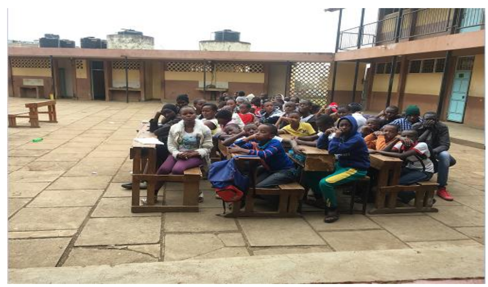
Students listening in an on a debate. Book club session.