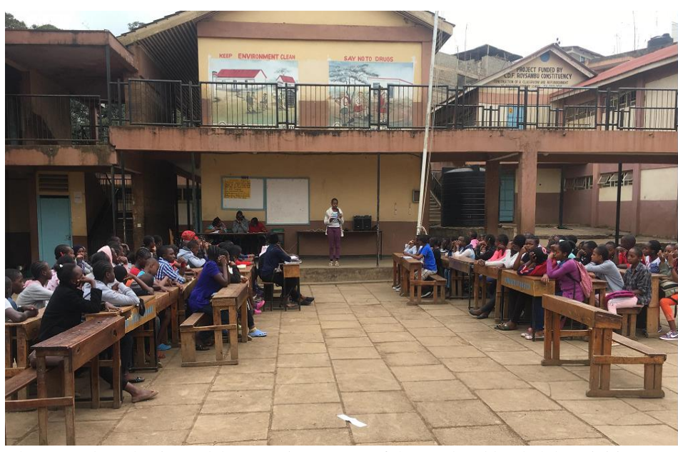
Class 8 students having a debate session as part of the weekend bookclub activities