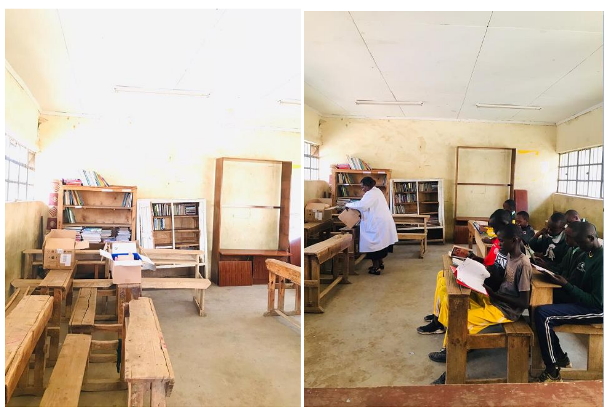
The library in progress