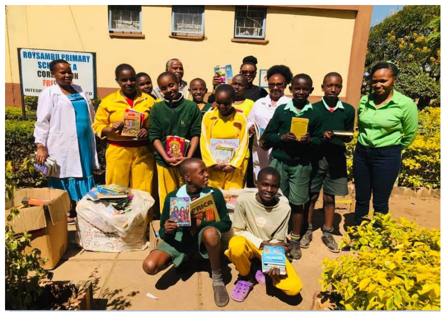
The Principal and some students receiving the book donations