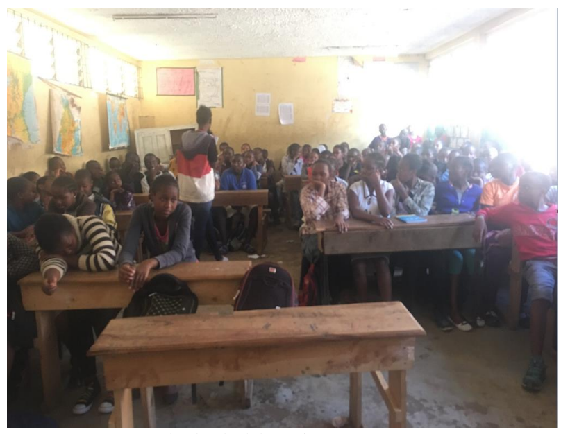
A Saturday book club session