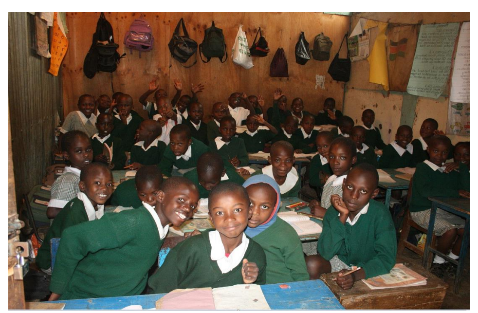
Class in session. One of the lower primary classes in session